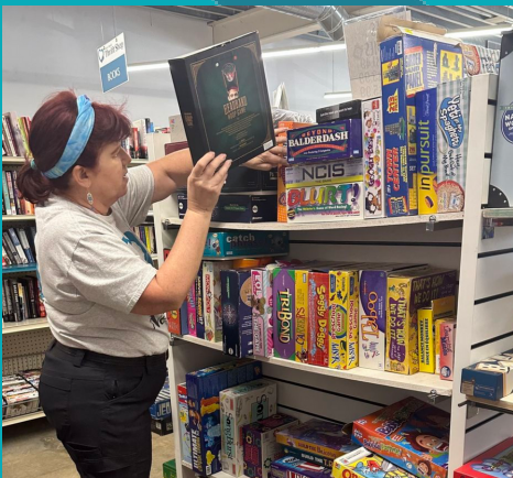
Organizing the thrift shop shelves