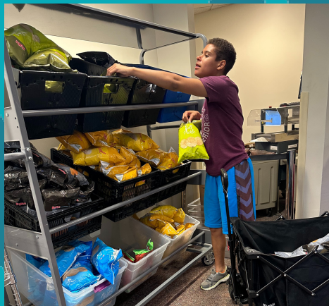
Restocking the Park Grove Library pantry