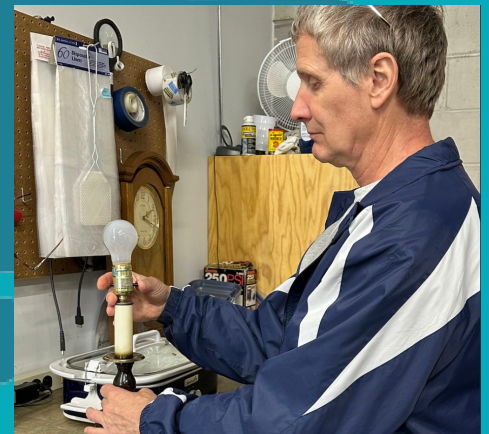
Testing donated electronics